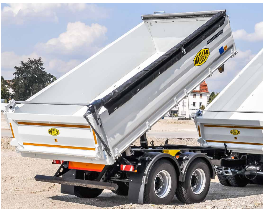
Side roll-up tarpaulin