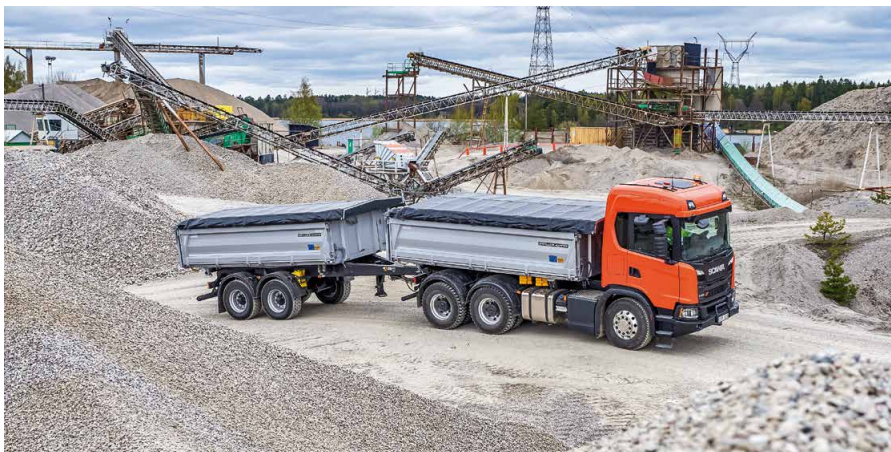
Electric sliding tarpaulin

MEILLER tarpaulin systems are optimally matched to MEILLER vehicles. Benefit from an integrated, modular solution from a single source. Whether a three-way tipper, rear tipper, tipper trailer or centre-axle trailer: All MEILLER superstructures are prepared for the use of a tarpaulin system.